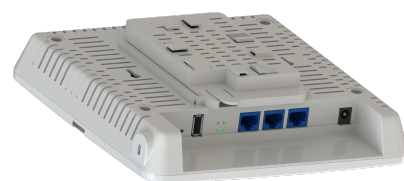
I/O Region (all models)